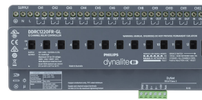
Front of the DDR1220FR-GL 12 x 20A Relay Controller