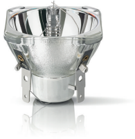
MSD Platinum 2 R