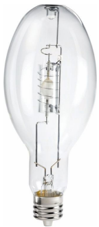
EX39, ED-37, Clear