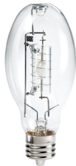
EX39, ED-28, Clear