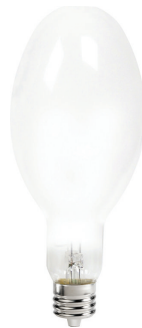
EX39, ED-37, Coated