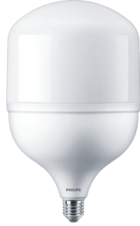
LEDTrueForce E26 120-240V 45HB