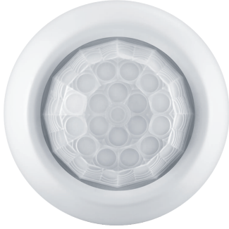
LEDTrueForce HB Accessory