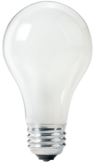
E26, A19, Frost Silicone