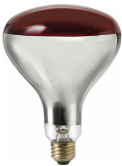
E26, R40, Red