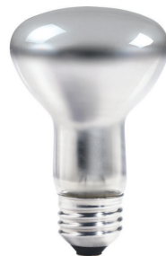
E26, R20, Frosted