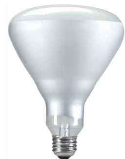
E26, BR40, Flood, Clear