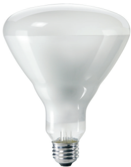
E26, BR40, Flood, Frosted