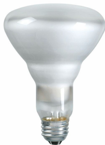
E26, BR30, Frosted