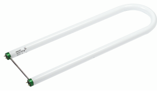
Medium Bi-Pin Fluorescent U-bent T 8/8 inch with 6" spacing