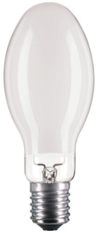
MASTER SON PIA Plus E40