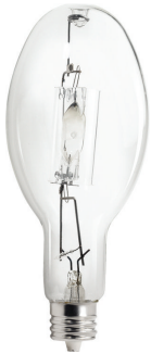
EX39, ED-37, Clear