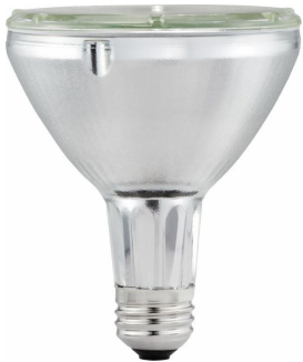
PAR30L Med. Base