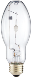
ED17 Clear Medium Elite