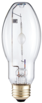
BD17, Med, CL, Elite