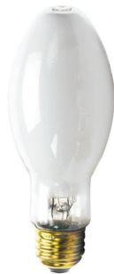
BD17 Medium Coated